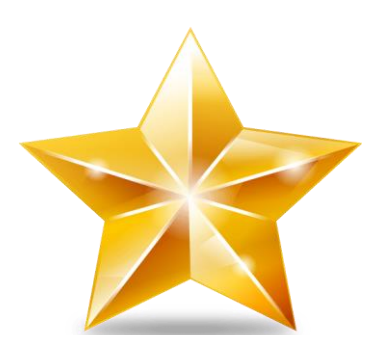
savYES - Shifnal and Albrighton Chirstian Youth Project